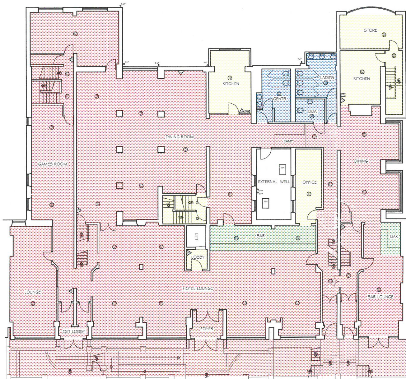
GROUND FLOOR LAYOUT INTERNAL FLOOR AREA 648m 2